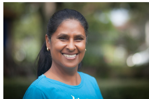
Shyamala Papa Shared Room B1 and B2